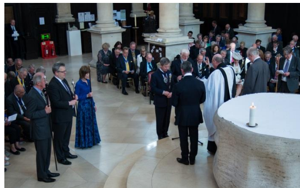
The Lord Mayor appointed as an Honorary Churchwarden

Any or all of these could be a reason for gratitude, while you may also appreciate St Stephen Walbrook for other reasons altogether.