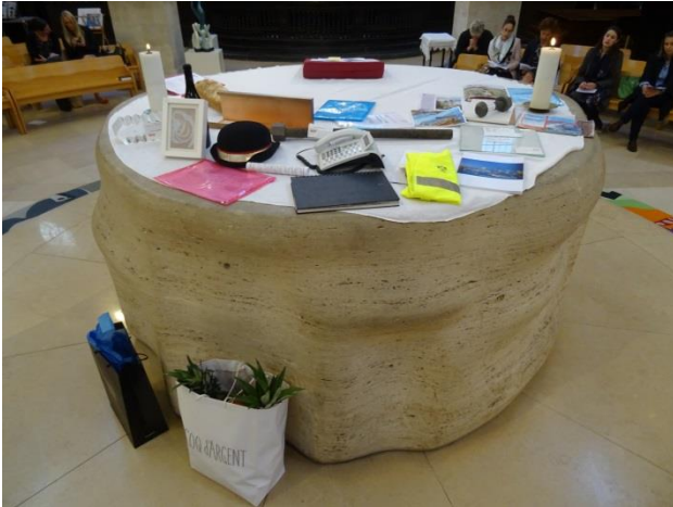
Symbols of work placed on our altar for the Business Harvest Festival

George Herbert said 'Thou that hast given so much to me, Give one thing more, a grateful heart.' That's our prayer for our giving campaign.