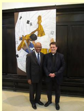
Jamaican High Commissioner