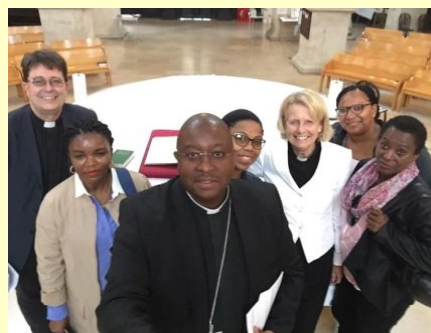
Johannesburg Cathedral group visit