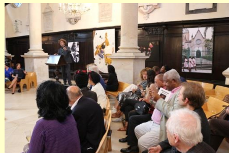
Private View - Jamaican Spiritual