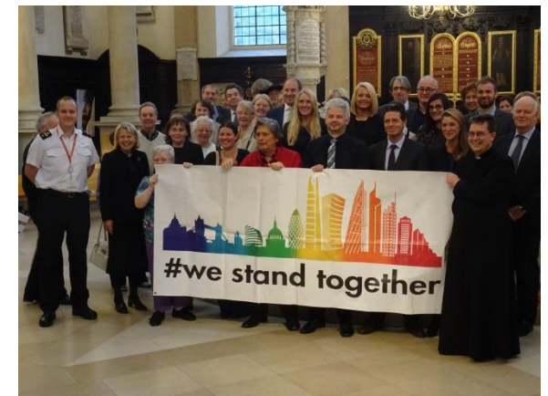
Members of our congregation following the Business Harvest Festival

Not thankful, when it pleaseth me; As if thy blessings had spare days: But such a heart, whose pulse may be Thy praise (George Herbert, Gratefulness)