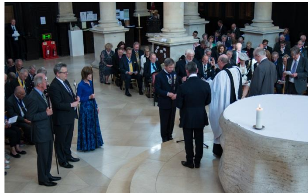
The Lord Mayor appointed as an Honorary Churchwarden

Any or all of these could be a reason for gratitude, while you may also appreciate St Stephen Walbrook for other reasons altogether.