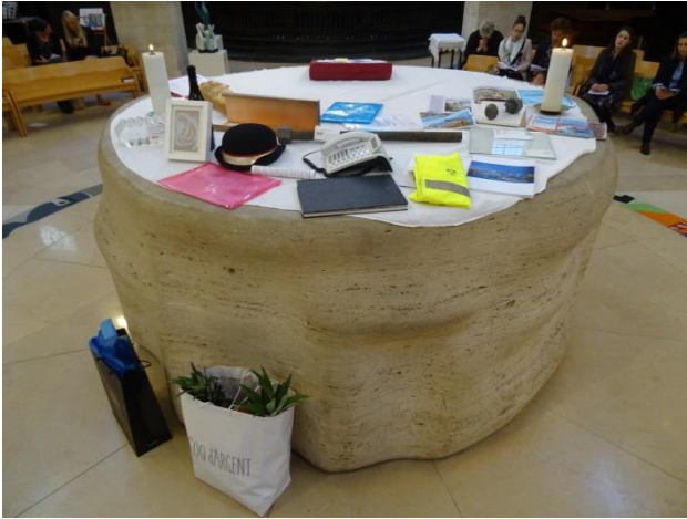
Symbols of work placed on our altar for the Business Harvest Festival

George Herbert said 'Thou that hast given so much to me, Give one thing more, a grateful heart.' That's our prayer for our giving campaign.